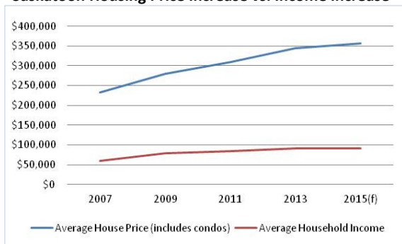
Saskatoon Housing Price Increase vs. Income Increase

The Saskatoon housing market has experienced rapid price increases since 2006. For example, in 2016, the average MLS resale price of a home increased to $356,462 in Saskatoon, a nearly 300% increase compared to a decade earlier. Rental prices also experienced a significant increase.