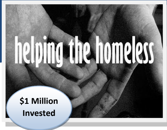
We provided research and development assistance for 114 affordable housing units